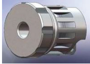
RATCHET ADAPTER FOR SCREWDRIVER